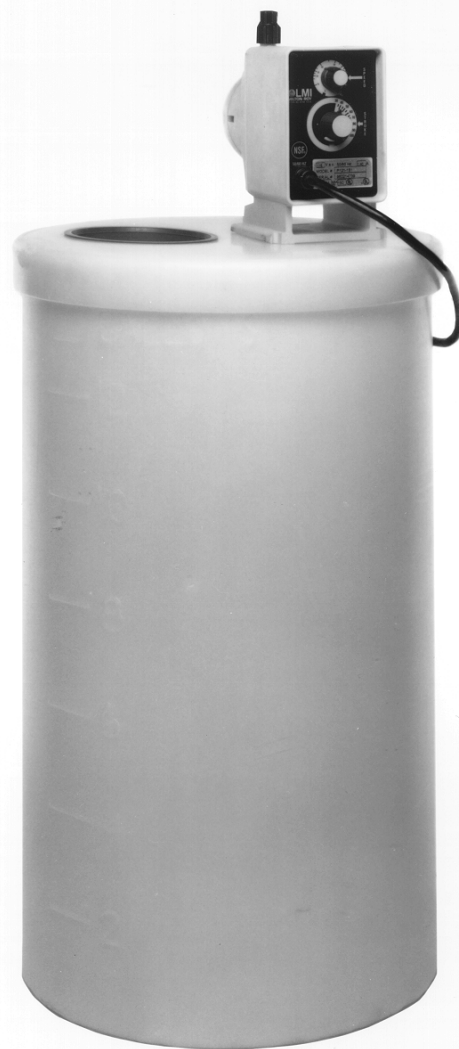
SHOWN WITH 15 GALLON FEED TANK