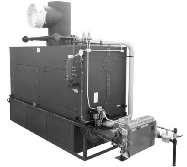
Power Burners Oil or Combination Fired Low NOx Available