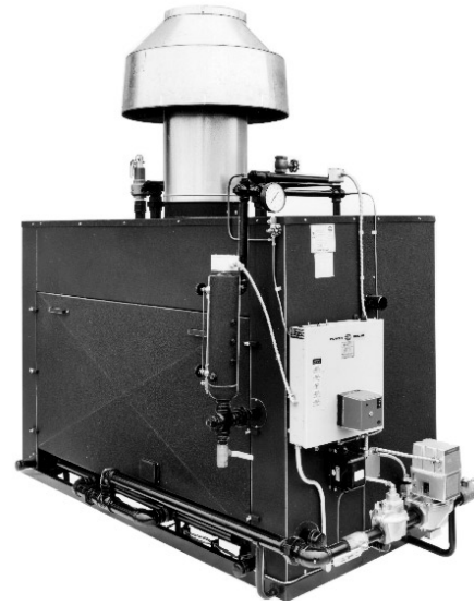
Parker Steam Boilers 30 to 150 HP