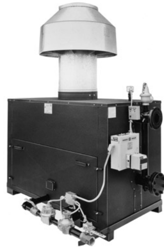
Hot Water Boilers 300,000 to 6,800,000 BTU