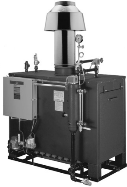
Parker Steam Boilers 1.5 to 25 HP