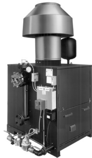
Indirect Hot Water Boilers 288 to 2878 Gallons/Hour 100°F Rise