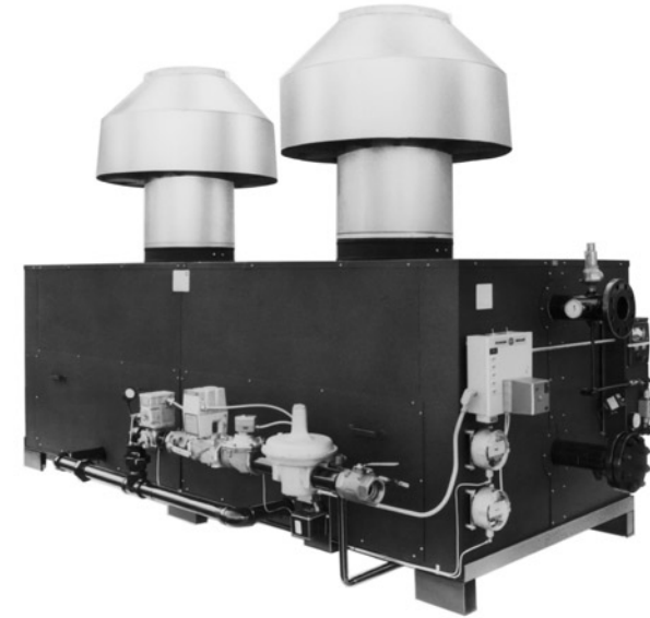
Thermal Fluid Heaters 126,000 to 6,250,000 BTU