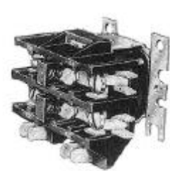
FIG. 2 R4243B